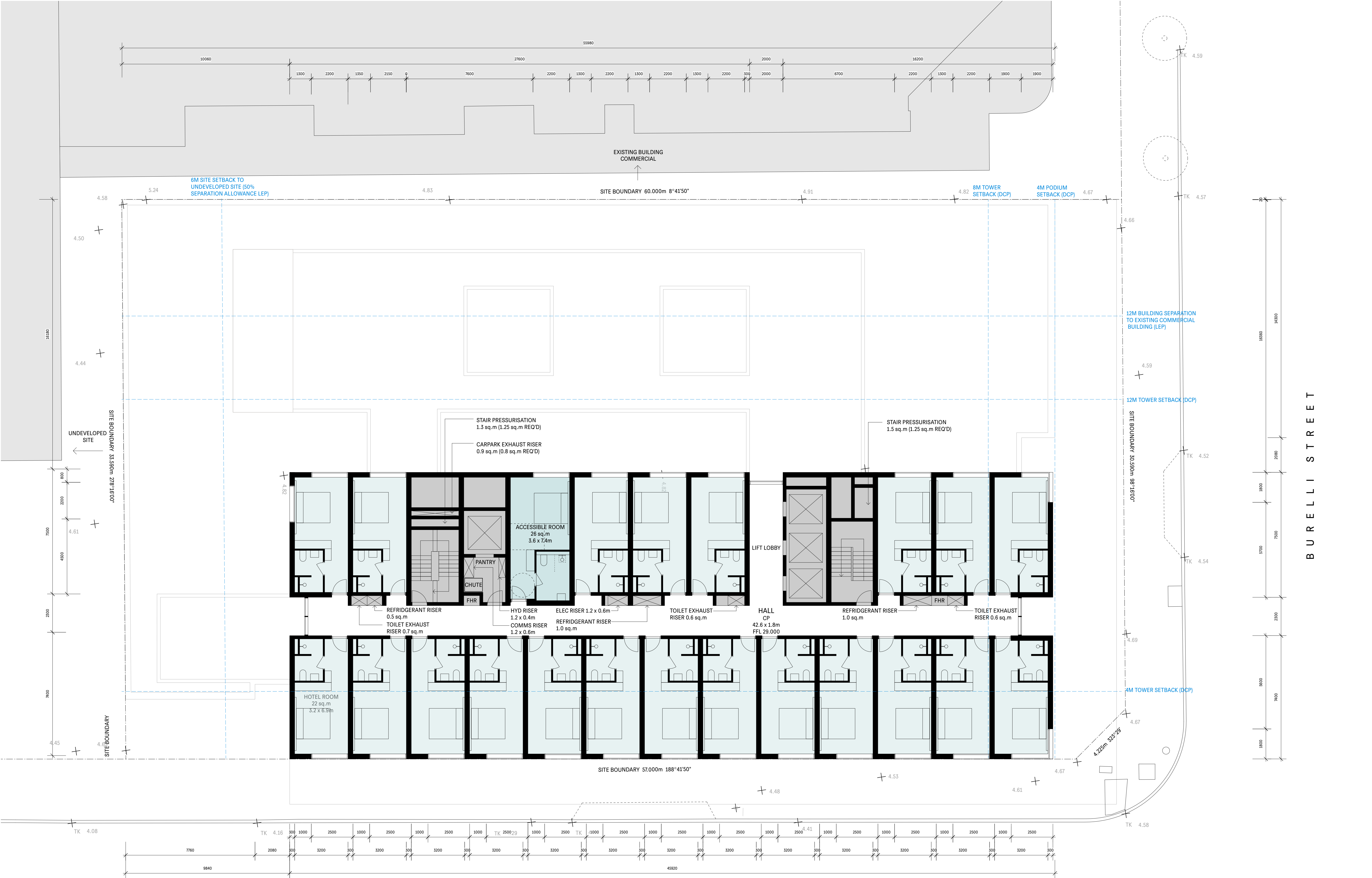
Tower Plan Level 7, 9, 11 1:100