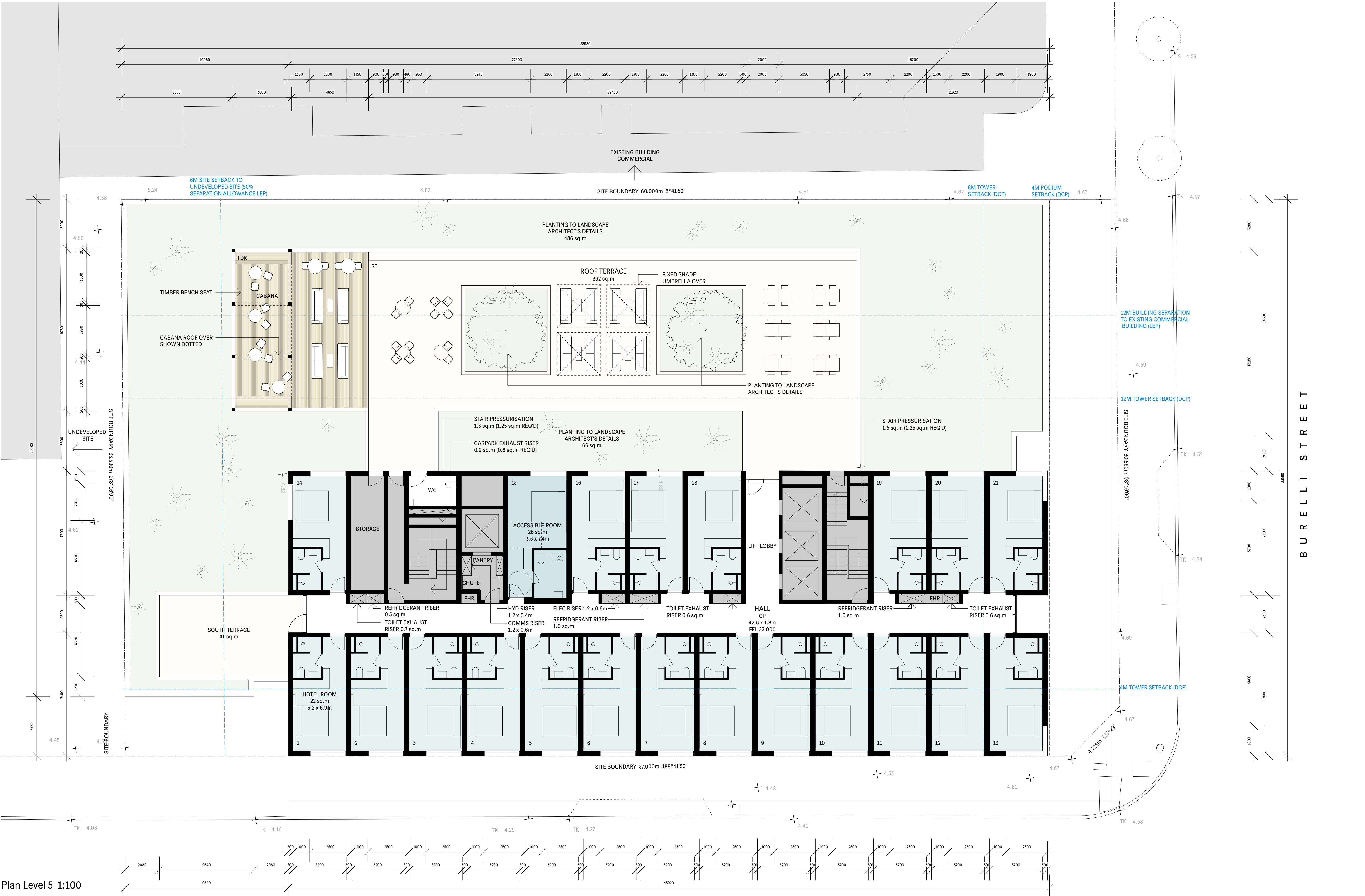
Plan Level 5 1:100