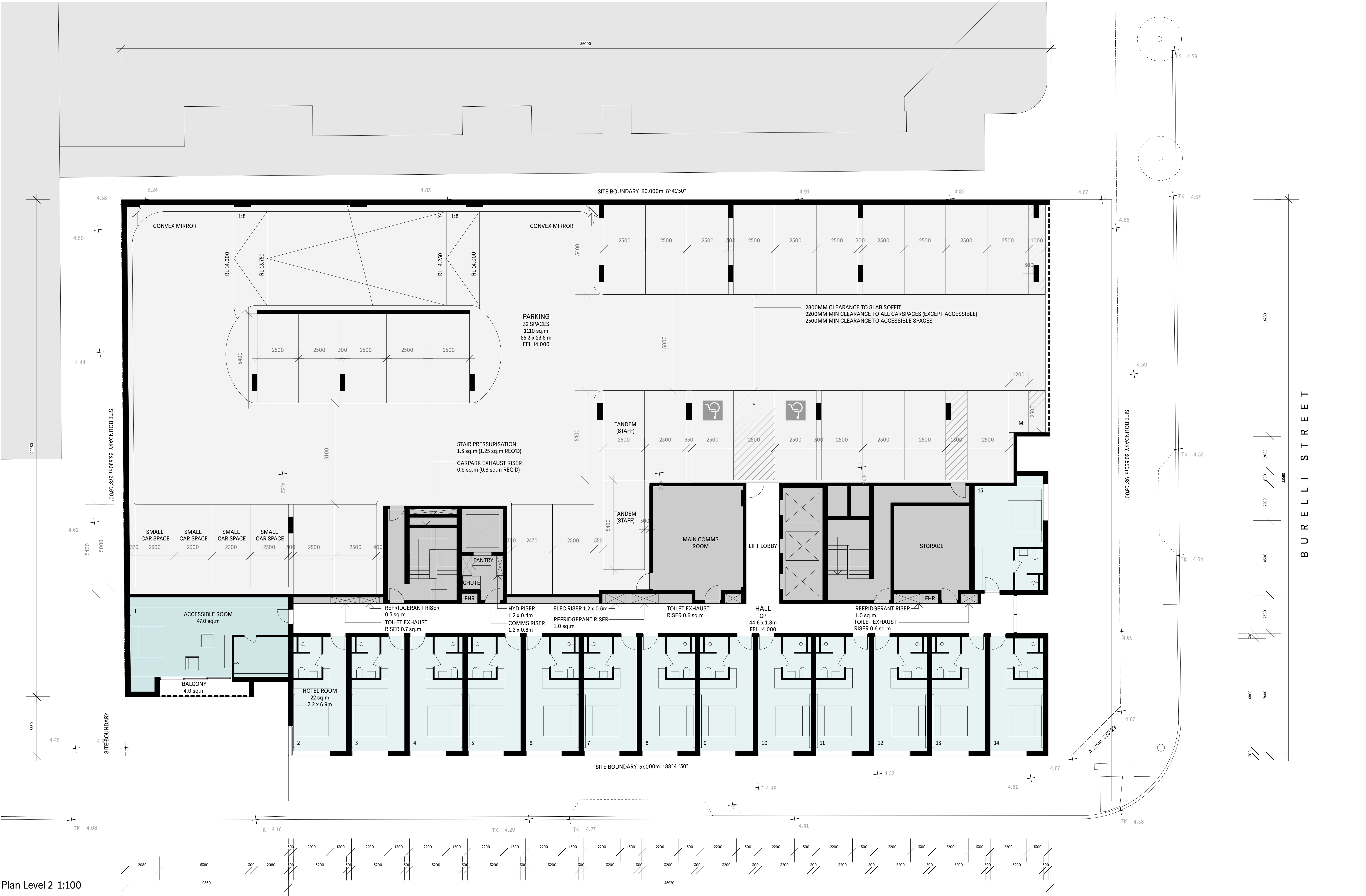
Plan Level 2 1:100